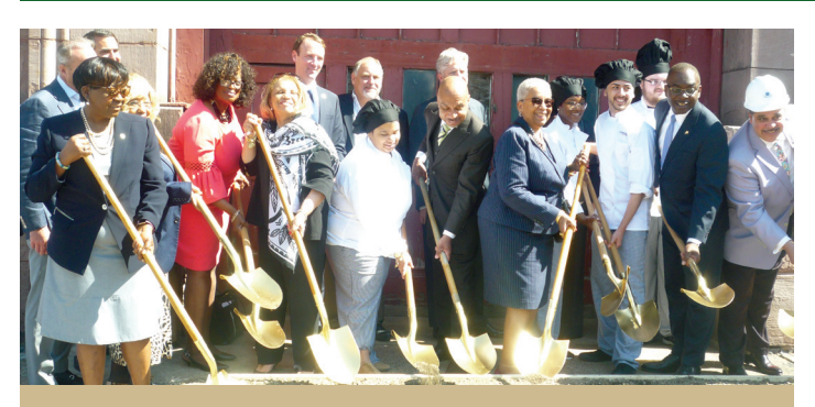
May 18th the Buffalo School District broke ground on the Emerson 2.0 School located at 75 West Huron Street, which is directly behind the current facility on Chippewa Avenue. It is expected to be open for students beginning September 2019.