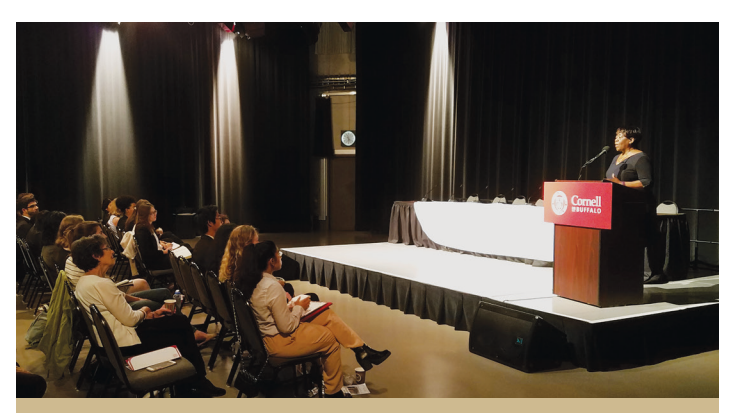
On June 23rd the Assemblywoman spoke to 30 fellows from the Cornell High Road Initiative who are actively volunteering with numerous WNY non-profits. Her speech focused on diversity and inclusion, the sealing of records for low-level marijuana convictions, and the eventual decriminalization and legalization.