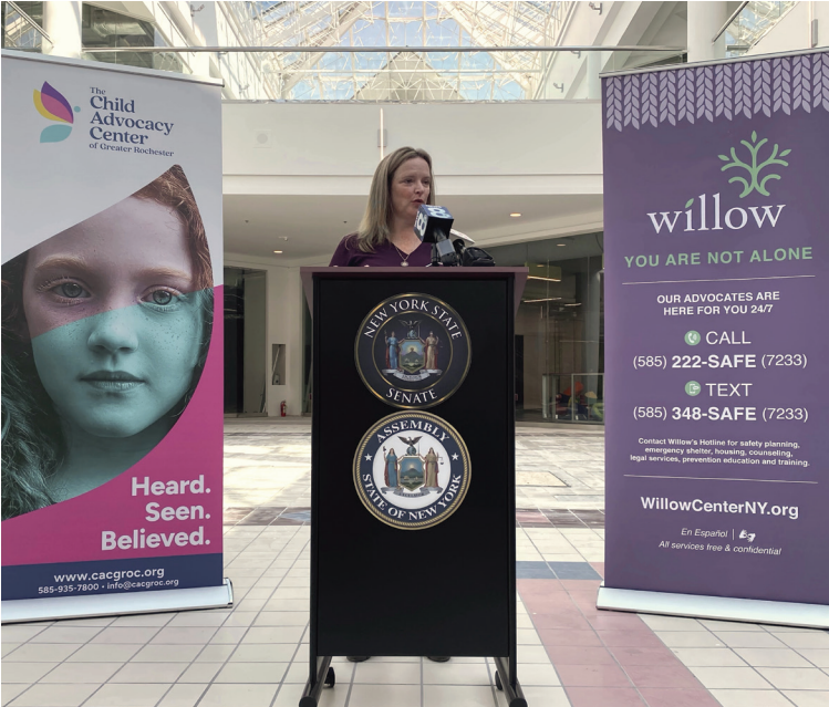
Announcing $4.2 million allocated in the 2024 state budget for the Family Justice Center in Irondequoit