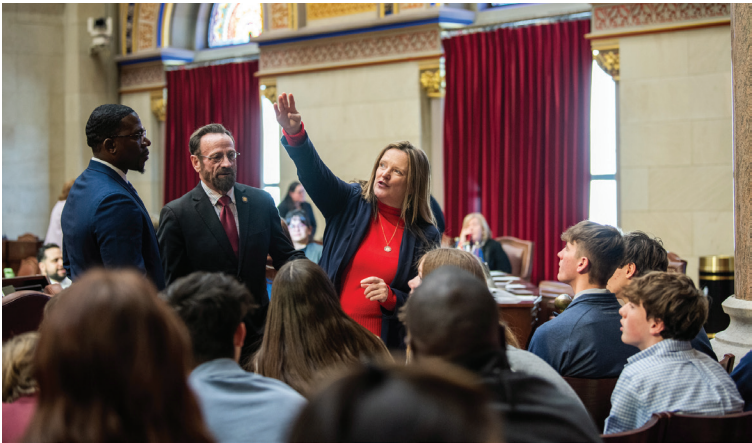
Showing the Aquinas Institute Diversity Club the Assembly chambers