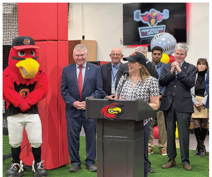
Opening the Red Wings Performance Center

This debt has been, and normally would be, paid by the employers. The $8 billion we fought to secure in the 2025-26 budget will be used to pay back the debt owed to the federal government, lowering the rates and eliminating the interest payments and burden on New York businesses. Also by eliminating the debt, New Yorkers that lose their job will be able to receive UI benefits that keep up with the cost of living, as the maximum benefit is currently set at 2019 levels.