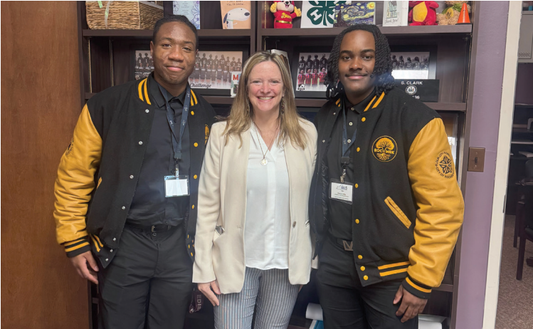
With students from Edison Career and Technology High School

Affordable and stable housing is still a top concern for many in the district. For the first time ever, this year's spending plan includes $50 million to establish the Housing Access Voucher Program (HAVP), a rental assistance program to help individuals and families who are homeless or at risk of homelessness secure permanent housing or transition out of shelters and unsustainable housing situations. It would also enable local housing agencies to avert evictions for the most vulnerable individuals and families.