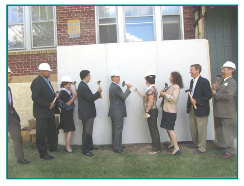
Assemblyman Magnarelli joined other elected officials in celebrating the revitalization of the Kasson Apartments and Leavenworth Apartments.

The Kasson Apartments, located at 622 James St., and the Leavenworth Apartments, located at 615 James St., will be renovated by the real estate development and management company, Conifer, to feature 65 market rate apartments and 18 apartments for low to moderate income families. When completed, Kasson will feature one-bedroom and two-bedroom apartments available at market value with rent set at about $800 to $1,000 per month. The building will also feature six two-bedroom units for lower income families with rent set at $681 per month. The project will be completed in 2013.