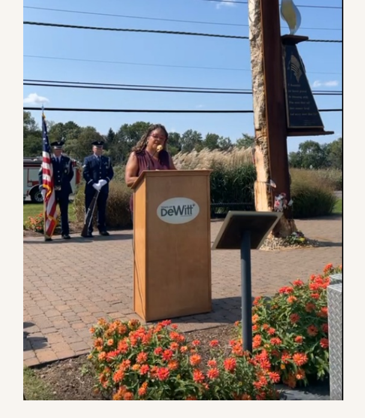
September 11, 2021

It was an honor to speak at the <u>Town of Dewitt 9/11 Ceremony</u> memorializing 20 years since the 9/11 attacks. While much has changed since then, we will never forget those we lost that day or later, as a result of injury or illness incurred. (My remarks begin around the 11:30 mark.)