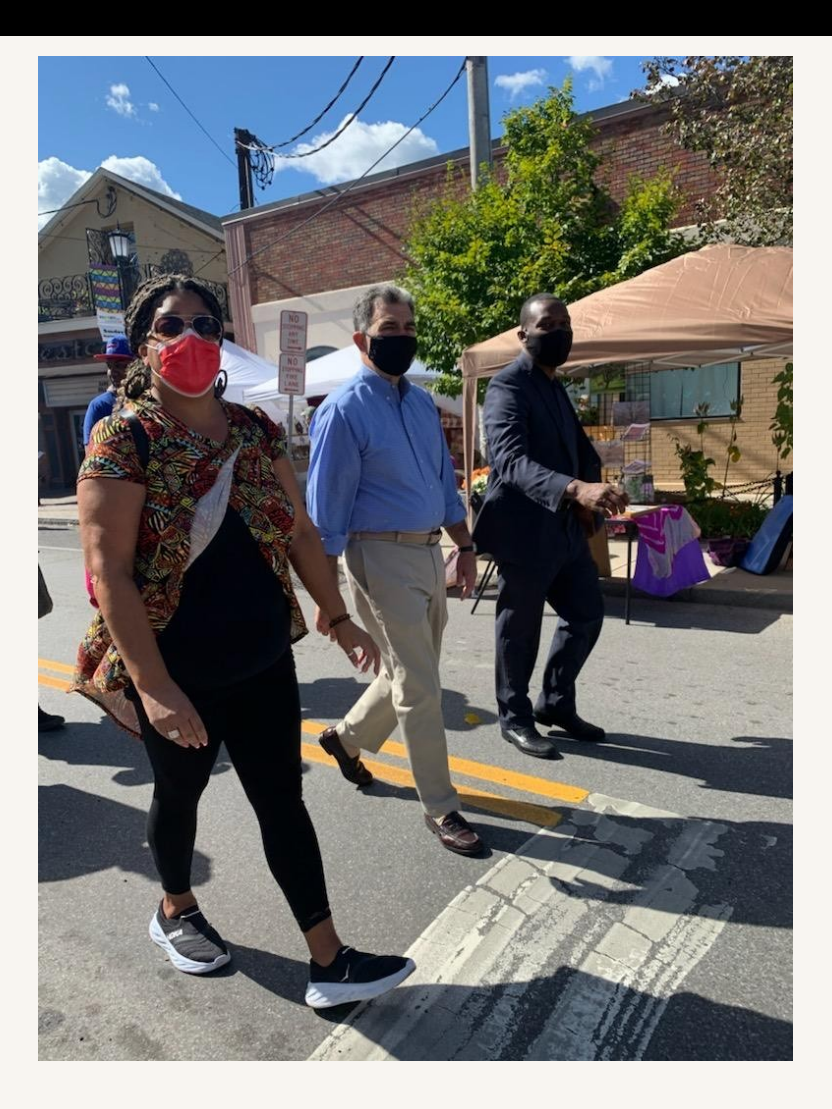
September 26, 2021

The Westcott Street Cultural Fair is one of my favorite events of the year!