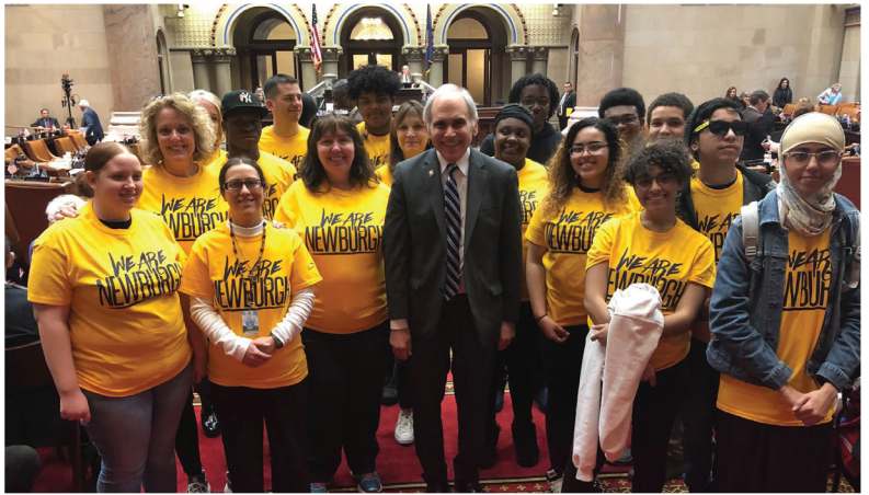
What a treat to have visitors from Newburgh Free Academy West and the Newburgh Free Library in the Assembly Chamber.