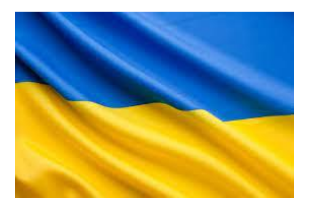
Help for Ukraine

International Rescue Committee World Central Kitchen Save the Children International Committee For the Red Cross UNICEF USA UN Refugee Agency Volunteer NY