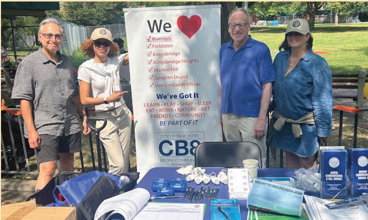
Assemblyman Dinowitz attended Marble Hill's NYCHA Family Day and is shown with Community Board 8 members.