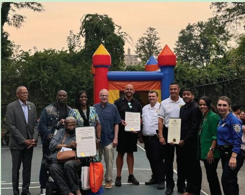
Assemblyman Dinowitz joined the 50th precinct for National Night Out, promoting unity and peace within the community. The community deeply appreciates the work the 50th precinct does, and Assemblyman Dinowitz will continue to work with the precinct to address community concerns and issues.