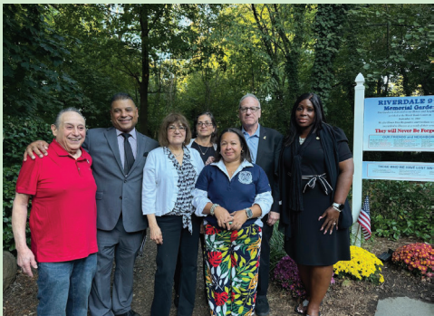
The Friends of Riverdale host an annual 9/11 Memorial Service at Memorial Garden, for a ceremony honoring local heroes and remembering the lives lost on 9/11 and since. First responders, elected officials, veterans, community members, and Americans come together seeking comfort and support on the anniversary of this tragic event each year.