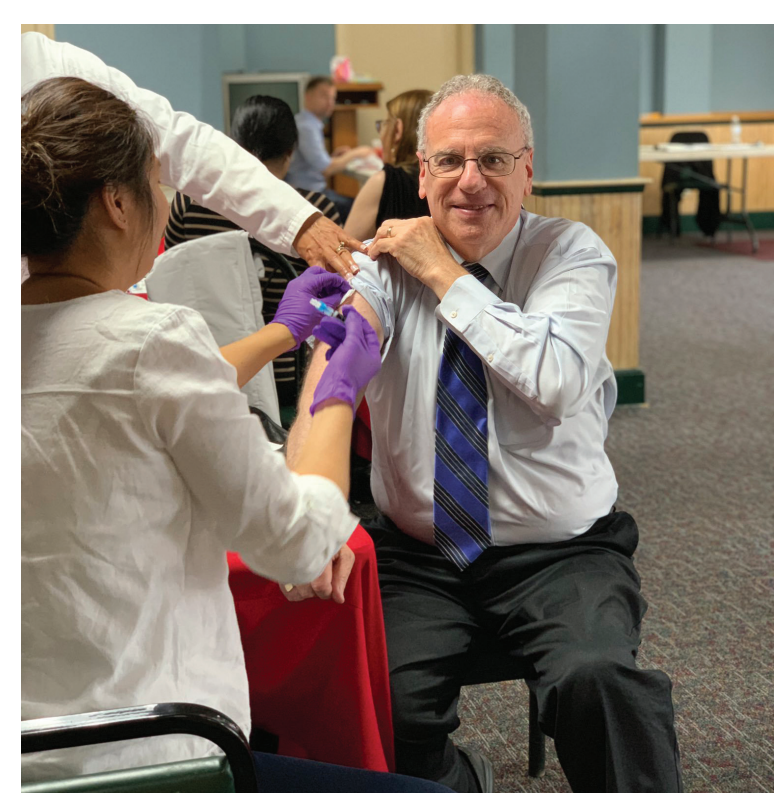
PROTECT YOURSELF FROM THE FLU: Getting a flu shot is about more than just protecting yourself. It's about protecting those around you, particularly those who are at higher risk from the flu – children, seniors, and people with compromised immune systems. I am proud to have continued my annual tradition of offering free flu shots for our community this year. We were at three locations: St. Gabriel's School, the Riverdale Y, and Vladeck Hall in the Amalgamated. If you haven't gotten your shot yet, there is still time to get one at your local pharmacy or doctor's office!

The proactive preventative approach taken by Erin's Law is an integral complement to the Child Victims Act, which is primarily focused on seeking justice after abuse has already occurred. New York must do everything in its power to protect children, and this new requirement accomplishes just that.