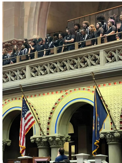
Singing in the gallery of the Assembly Chamber.