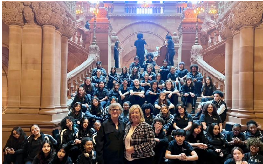
Upper East Side high school Talent Unlimited student musicians and singers performed at the New York State Capitol.