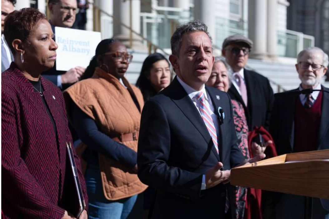
Assemblymember Simone Speaking At City Hall to Strengthen Democracy