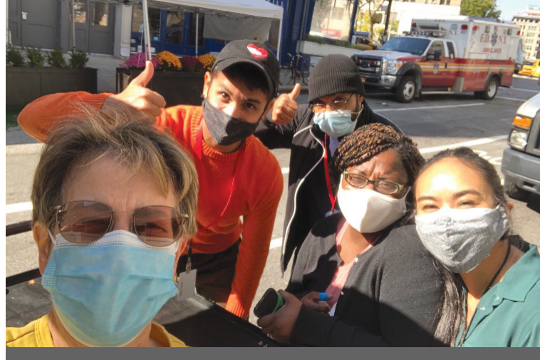
Delivering another round of hand sanitizer to the great team at God's Love We Deliver, a cherished community partner that continues working to assist New Yorkers during this unprecedented time.

Another critical issue will be to increase New York's renewable energy capabilities by expanding wind power. Unfortunately, wind turbines are sited for optimal power generation in heavily trafficked bird flight paths especially during migratory seasons. Therefore, I will strenuously push