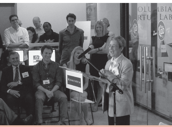
Assemblymember Glick speaking at Columbia's Start Up Lab in SoHo.