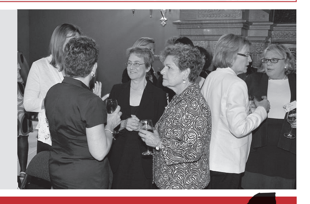
Assemblymember Glick with Assemblymembers Ellen Jaffee and Aileen Gunther.