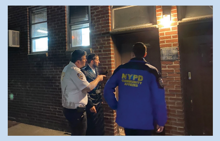
Assemblyman Simcha Eichenstein on the scene of a recent hate crime incident with NYPD personnel

"Victims of hate crimes should not be victimized a second time due to their insurer's decision refusing to renew their policies or increasing their premiums," said Assemblyman Eichenstein. "This legislation would ensure that their coverage remains intact."