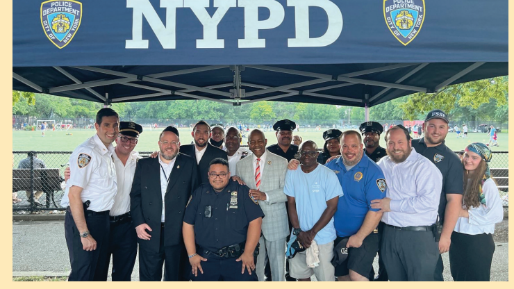
66th Precinct 70th Precinct