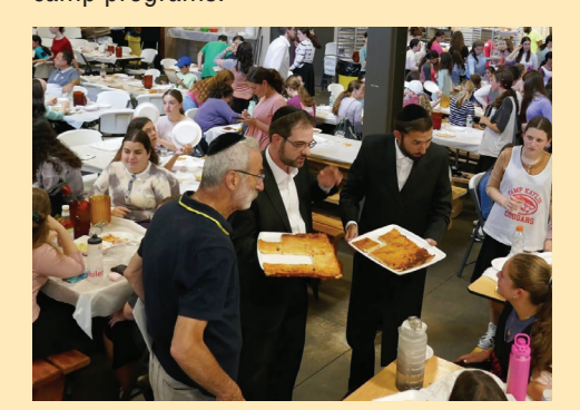
Pizza Day at Camp Kaylie

"Our visit to Camp HASC and Camp Kaylie was an inspiring and uplifting experience," said Assemblyman Eichenstein. "Every child, no matter their ability, deserves a memorable and incredible summer experience which is only possible thanks to the dedicated staff at these unique camp programs."