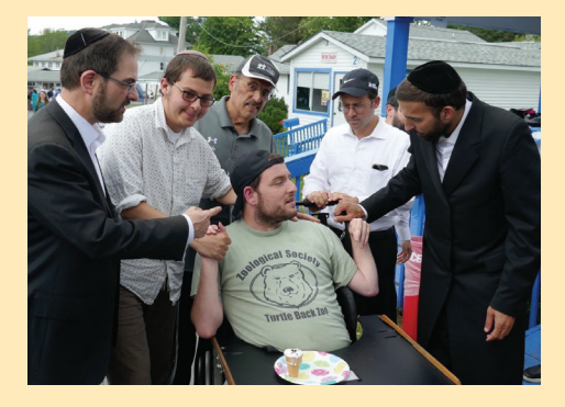
At Camp HASC - "The Happiest Place On Earth"