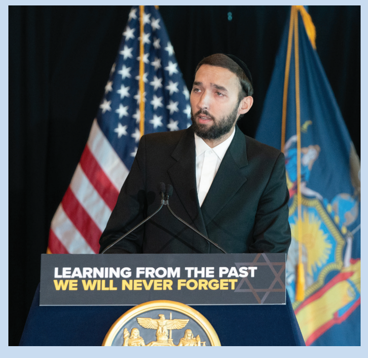
Assemblyman Simcha Eichenstein Speaking at Governor Hochul's Bill Signing Ceremony

Assemblyman Eichenstein's district includes the largest number of Holocaust survivors in the nation and he is keenly attuned to their needs. "Our elderly survivors who have endured so much should not be charged corporate transaction fees for payments that are rightfully theirs," he said. "They deserve better."