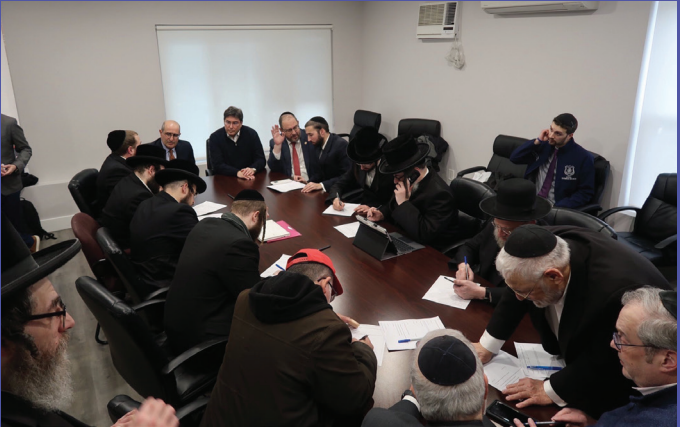
Synagogue representatives complete applications for the new security funding program at Assemblyman Eichenstein's district office

"We had a tremendous turnout and we've generated a lot of interest in this program," said Assemblyman Simcha Eichenstein. "The concern about antisemitism in our area is real, and clearly the community is prepared to do everything possible to protect itself."