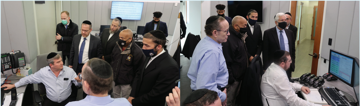
Speaker Heastie and Assemblyman Eichenstein Visit Central Hatzalah Dispatch Room

Speaker Heastie and Assemblyman Eichenstein first visited Imagine Academy, where they saw firsthand the dedication and commitment of the staff who work with special education students, specifically students with autism. Speaker Heastie was inspired by the warmth and caring of those who work with special needs children. They also discussed and highlighted their efforts to address the difficulties that parents face while navigating the bureaucracy of reimbursement for educating their special needs children in New York City.