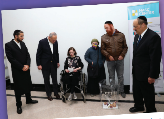
Assemblyman Eichenstein joined HASC Center in a special presentation to Senate Majority Leader Charles Schumer as they expressed appreciation for his continued friendship and advocacy on behalf of special individuals.