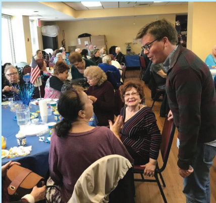
Visiting the Senior League of Flatbush.