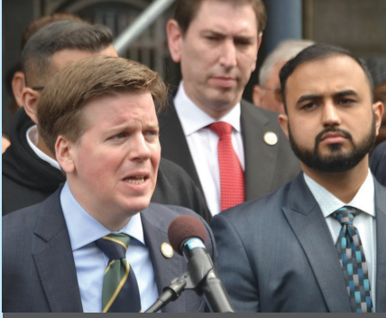
Standing against hate with elected officials and leaders of all faiths in response to the mosque shootings in New Zealand.