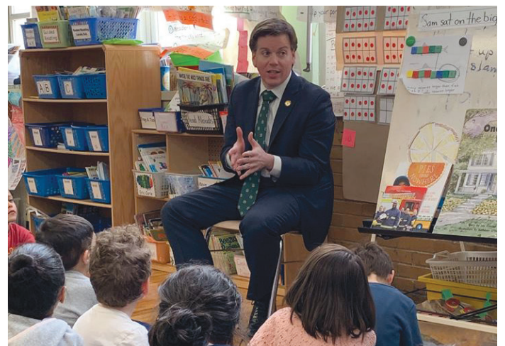
Assemblymember Carroll speaks with students at PS 10.

This year's budget includes $27.86 billion in general support for public schools, a $1 billion increase over the 2018-2019 school year, and a total of $18.4 billion in Foundation Aid. The increase of $622 million in Foundation Aid support (the main funding source for classroom support) however was less than half the amount initially requested by the Assembly. I will continue to fight on behalf of our students to fully fund Foundation Aid and provide more support for our classrooms.