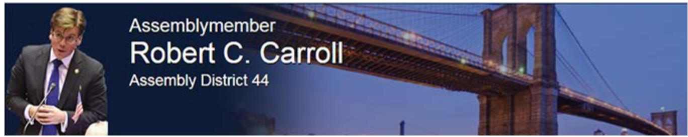
March 22, 2019