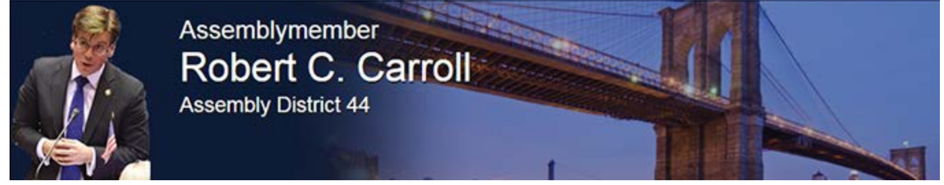
March 1, 2019