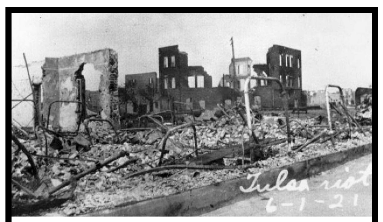
Impact of the Greenwood district following the race massacre.

About 10,000 Black people were left homeless , and property damage amounted to more than $1.5 million in real estate and $750,000 in personal property (equivalent to $32.65 million now), while it is believed that as many as 300 died and thousands were injured.