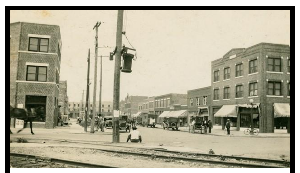
A greenwood district street.

The massacre began Memorial Day weekend after a young Black man, Dick Rowland , was falsely accused of assaulting a young white woman, Sarah Page in an elevator at the Drexel Building. Rowland was subsequently arrested and it was reported that he would be lynched . A group of 75 Black men subsequently gathered near the jail, to prevent the lynching.