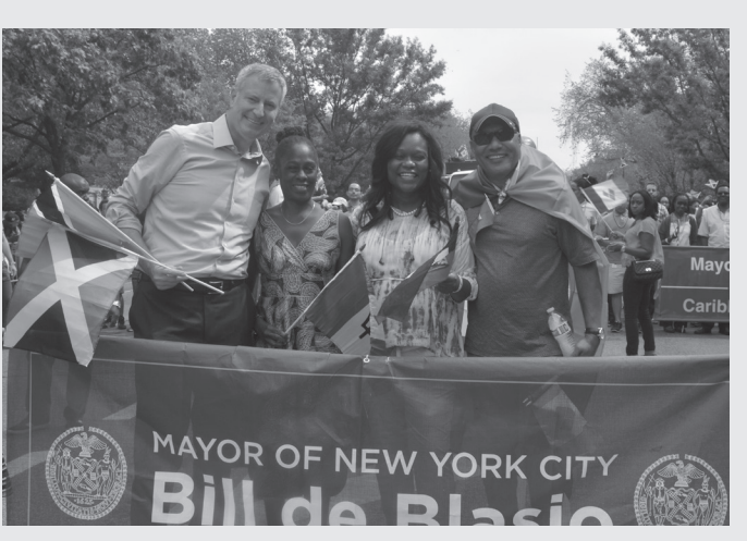
Assemblymember Bichotte with Mayor de Blasio, the First Lady Chirlane McCray, and Commissioner Jacques Jiha.