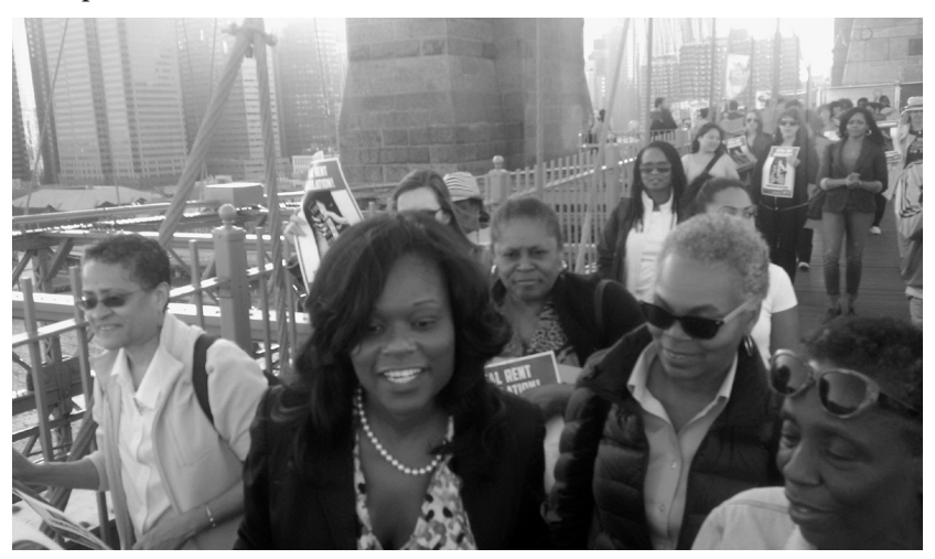
Assemblymember Bichotte walking with members of the Flatbush Tenant Coalition across the Brooklyn Bridge to Foley Square to demand stronger rent laws.