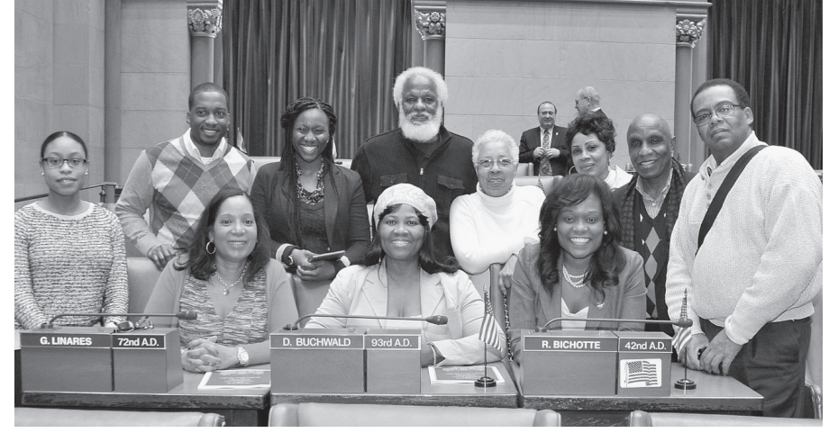
Constituents and well-wishers joined Assemblymember Bichotte on the first day of session.