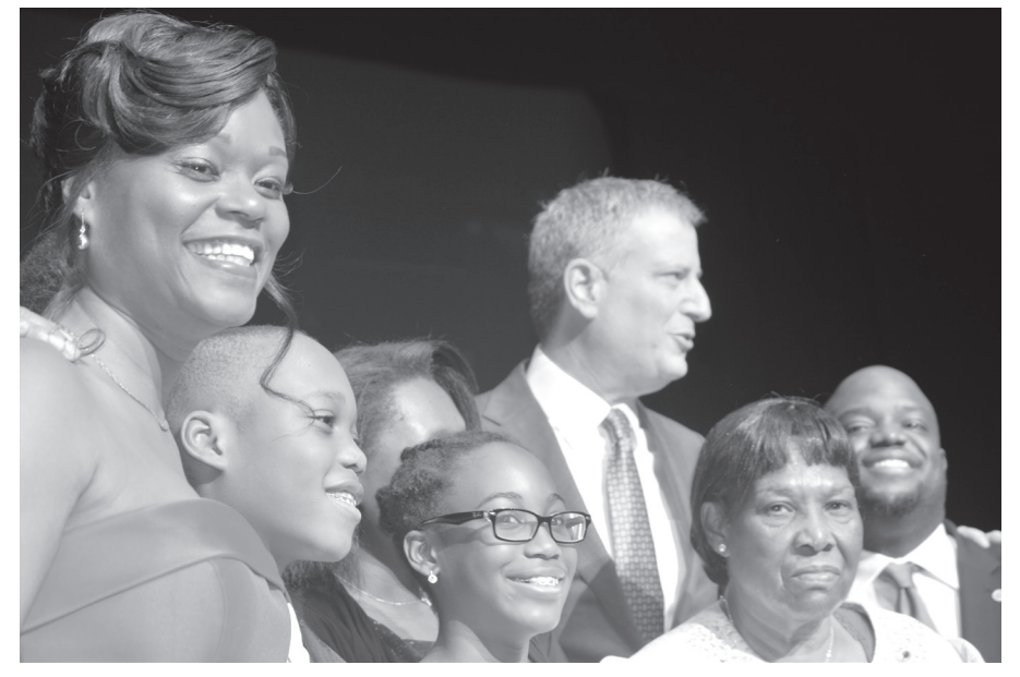
Assemblymember Bichotte surrounded by her family after being sworn in by Mayor Bill deBlasio at Brooklyn College's Walt Whitman Theatre.