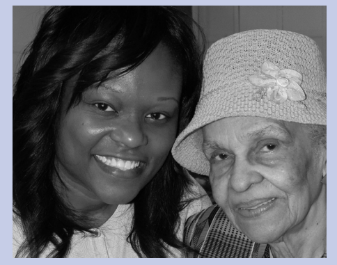
Third Annual Senior Luncheon —

Housing Resource Fair — Saturday June 13, in partnership with Neighborhood Housing Services, Brooklyn College Student Center, 2nd Floor, 2900 Campus Road, 10 a.m. - 3 p.m.