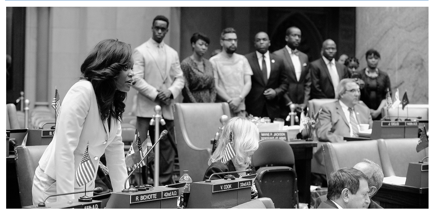
Assemblymember Bichotte on the floor urging her colleagues to support Resolution K376. She is joined in the chamber by concerned representatives of both Dominican and Haitian organizations.

K376/Urging the United States Congress to adopt House of Representatives Resolution 443 - resolution to acknowledge the human rights violations committed against denationalized Dominicans of Haitian descent.