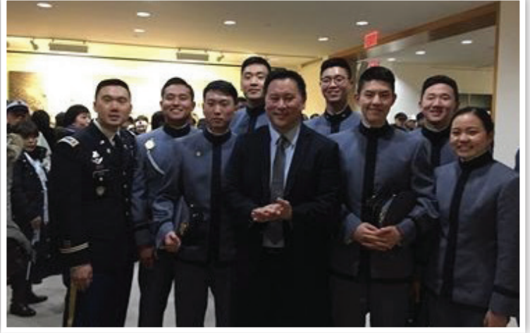
Assemblymember Kim met with young West Point cadets near the United Nations Headquarters.

New York State Assembly • Albany, New York 12248