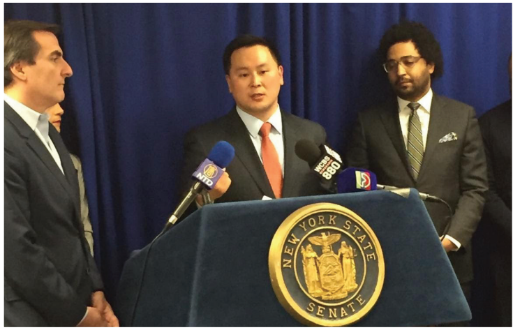
Assemblymember Kim announced legislation that creates an interstate compact designed to reel in corporate subsidy packages.