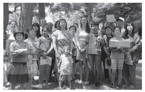
Opening up our parks

This year, we began replanting trees felled by Hurricane Sandy in Hillcrest. Following Hurricane Sandy, my office coordinated with the Greening Eastern Queens Initiative to locate trees that were damaged as a result of the storm. This process has identified approximately 100 trees throughout the community just in time for the next planting season.