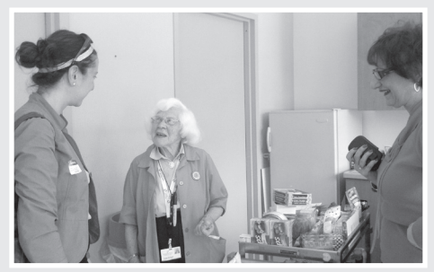
During this year's state budget, I worked to secure $1.3 million for elder abuse education and prevention programs, senior nutrition programs, and adult day care and transportation services.