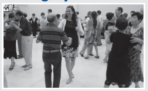
This summer, I had a chance to exchange fancy footwork and community ideas with seniors at the Self-Help Rosenthal Senior Center.