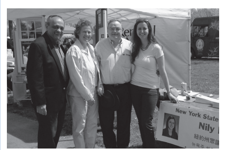
Improving parks for all

I celebrated Earth Day in Flushing this year by attending the Queens Botanical Garden's Arbor Fest celebration. My office had a booth where local residents and community members could inquire about upcoming workshops, events and other family-friendly activities.