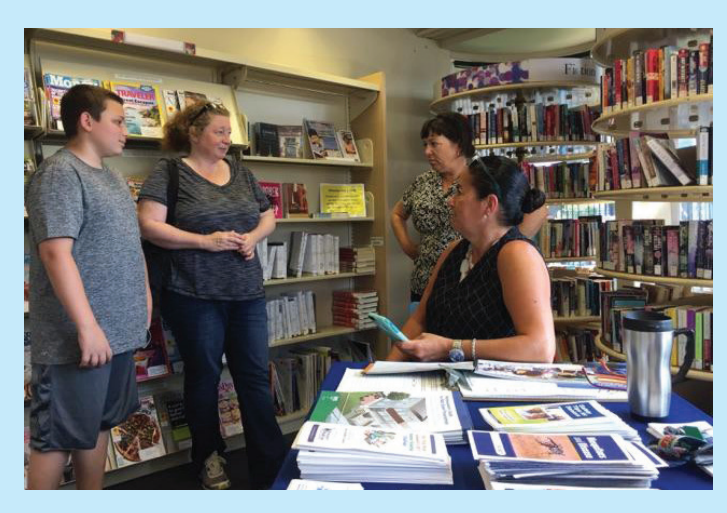
Supporting Our Public Libraries – Continuing New York's commitment to local libraries, the budget provides a total of $96.6 million, an increase of $1 million over last year, and $34 million to support library capital projects across the state.