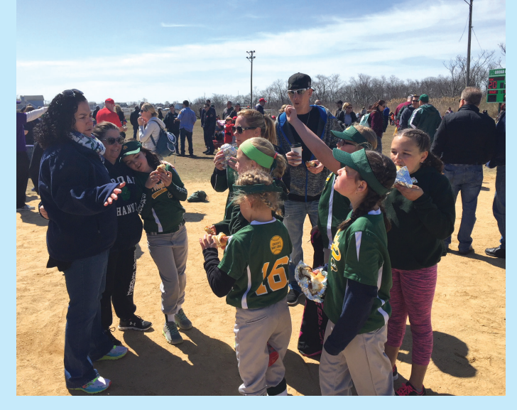
Investing in Families and Children – As Chair of the Committee for Child Product Safety, my priorities include ensuring that our hardworking low- and middle-income families have access to high quality, affordable child care and early childhood education, as well as securing funding for vital programs and services to support our most vulnerable children and youth, our caregivers and families, and the dedicated individuals who work on the frontlines.