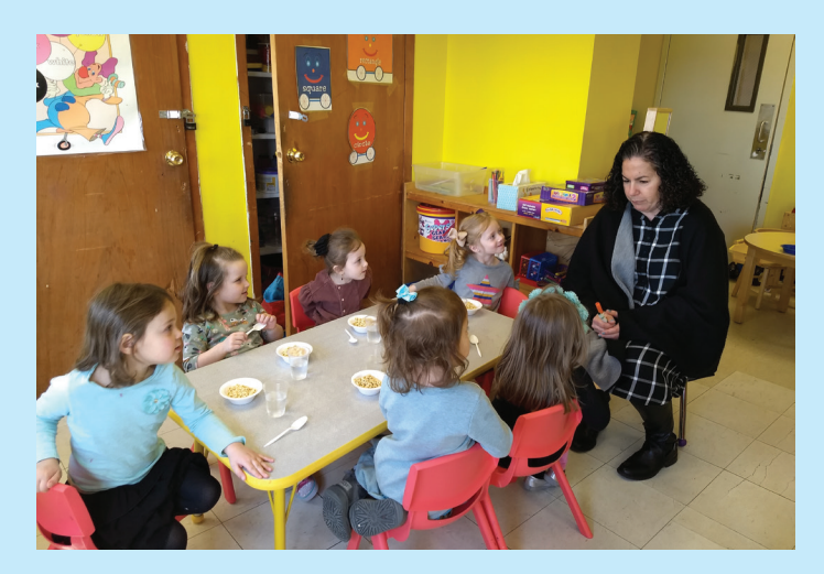
Strengthening Child Care – The budget invests close to $80 million ensure safe, affordable child care, including: