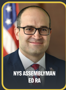
NYS ASSEMBLYMAN ED RA

EAST MEADOW PUBLIC LIBRARY AUDITORIUM 1886 Front Street East Meadow, NY 11554