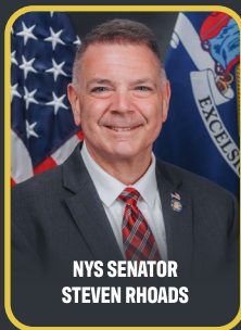
NYS SENATOR STEVEN RHOADS