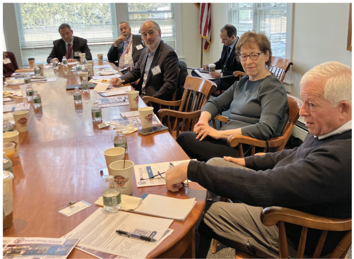
With public education being among Assemblymember Lavine's priorities, he takes the opportunity to meet with officials with the North Shore Central School District.