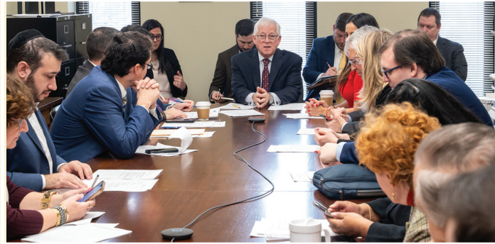
Ensuring the integrity and safety of the NYS Unified Court System is a priority for Lavine who serves as Chairman of the Assembly Judiciary Committee. Lavine leads a meeting of the powerful committee in Albany.