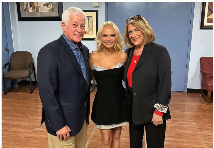
A special night at the Tilles Center with a performance by the talented Kristin Chenoweth. The night also featured the announcement of a programmatic state grant secured by Assemblymember Lavine to support the LIU Brookville campus gem of arts and culture.