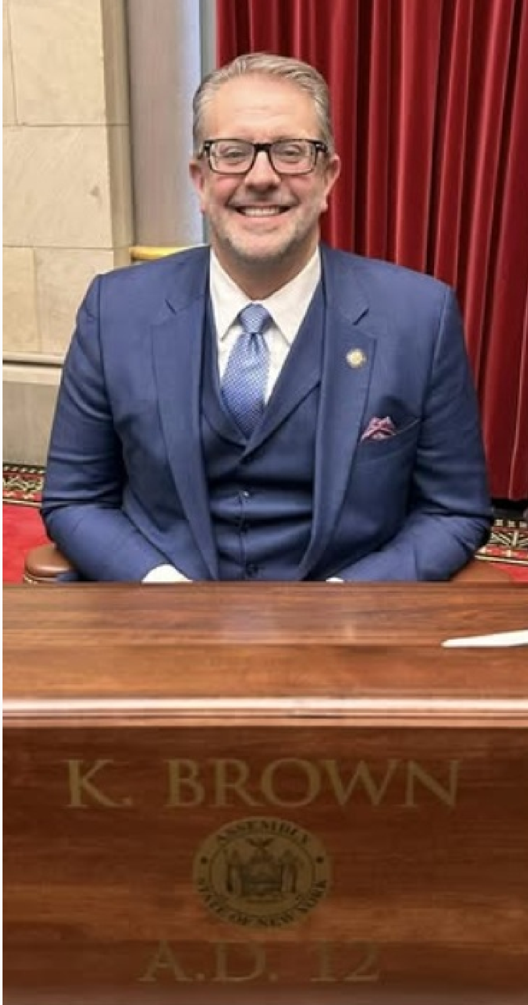
Oath of Office 2025