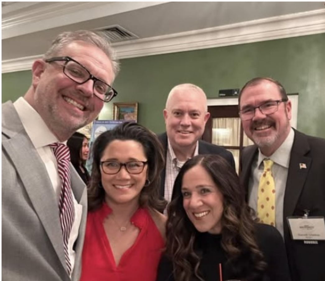
Rotary Environmental Action Coalition of Huntington (REACH) Honored