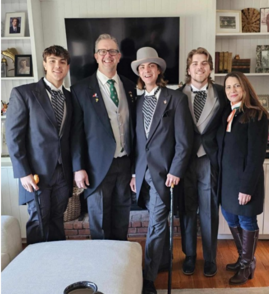
It's a tradition. First, we all go to church! (March 9)