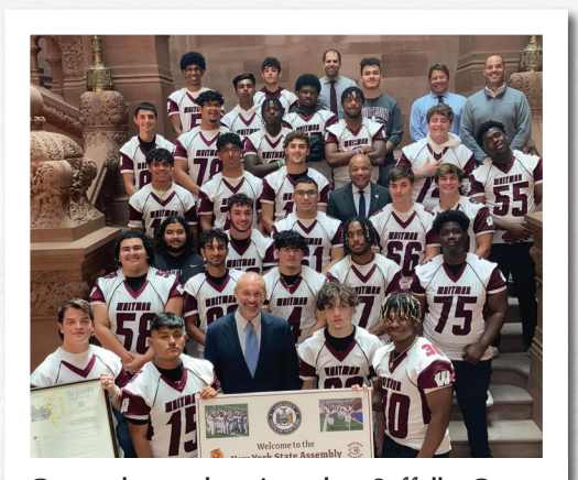
Great day welcoming the Suffolk County Champion Walt Whitman Wildcats Football Team to the state Capitol in Albany.