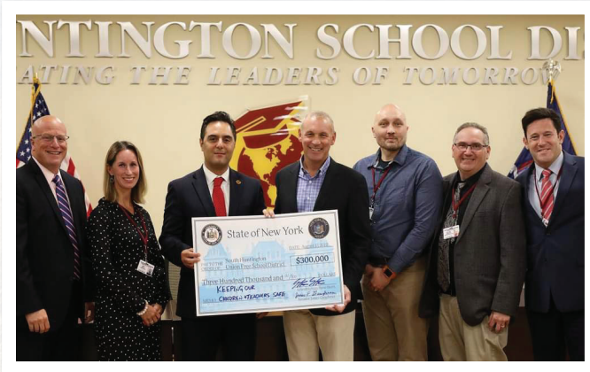
Delivered a significant grant to the South Huntington School District to strengthen school security and keep our children and teachers safe.