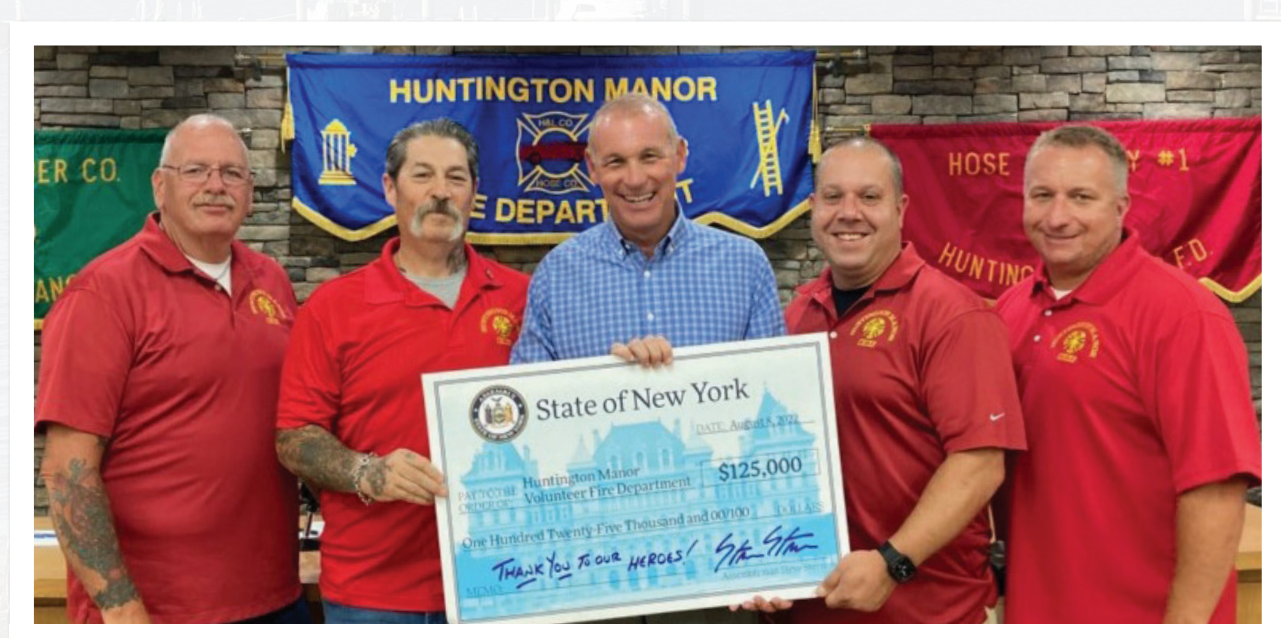
Presented a grant to our heroic volunteer firefighters for vital life-saving equipment.