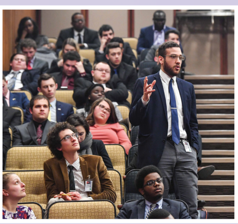
2019 Graduate Scholar Seminar Series