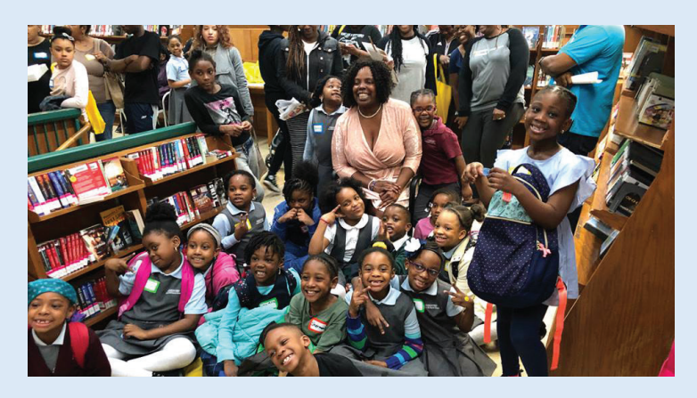
Assemblywoman Walker reading with the kindergartners, first, and second graders at the library!