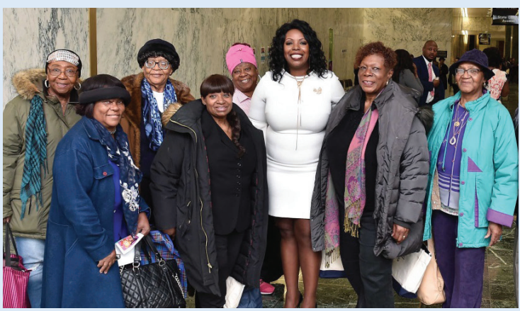
Assemblywoman Walker with constituents from the district in the Capitol for the New York State Association of Black and Puerto Rican Legislators Caucus weekend.